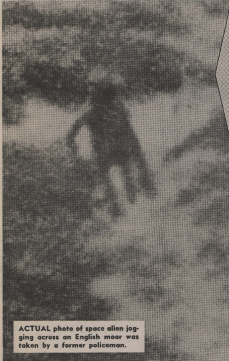
ACTUAL photo of space alien jogging across an English moor was taken by a former policeman.